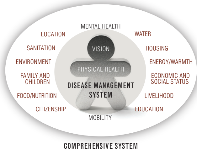
A comprehensive system will encompass social and environmental conditions